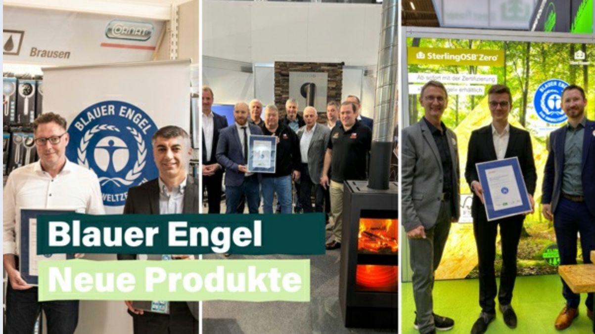
Presentation of certificates to Conmetall Meister, xeoos GmbH and West Fraser (from left to right).