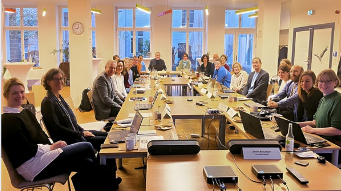
The 14 members of the Environmental Label Jury met in Berlin and decided on two new Basic Award Criteria for the Blue Angel.